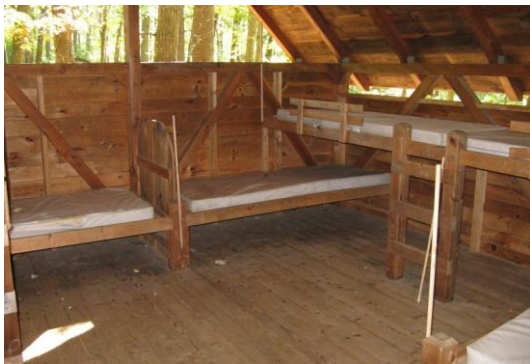
Inside an open air cabin.