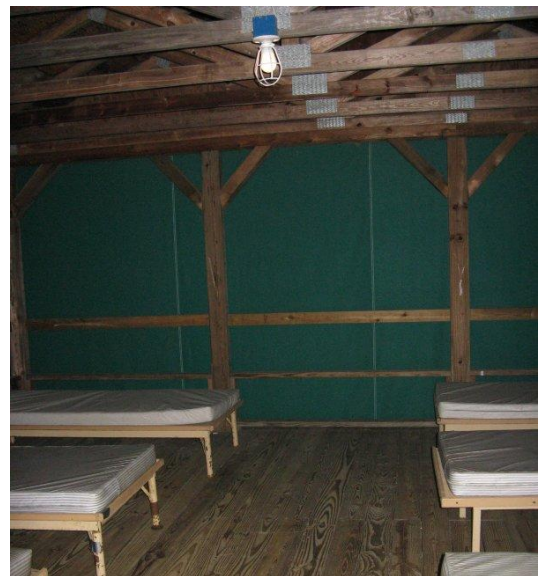
Inside a tentalo.