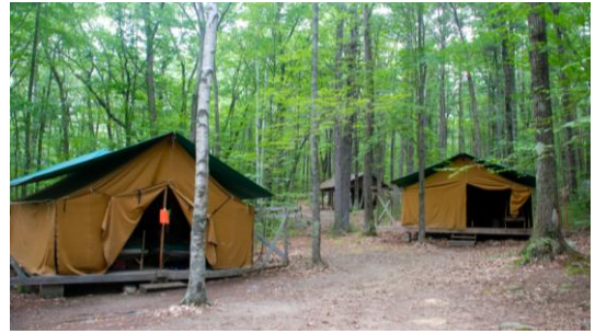
A platform tent unit.