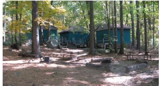
A tentalo unit.