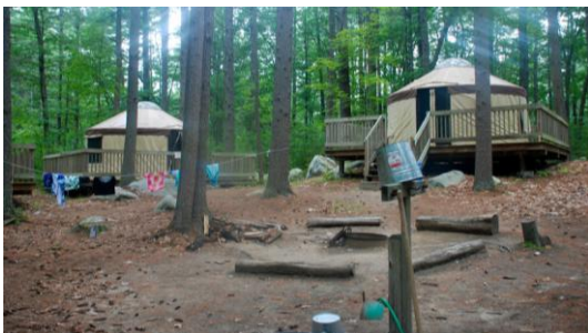
A yurt unit.