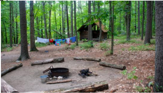
An open air cabin unit.

Camper who stay at Runels will live in platform tents, yurts, open air cabins, or tentalos holding 4 to 6 girls. Each girl will have a cot with a mattress. A bathroom is located near each unit. Hot showers are located in the central shower house. Each unit has a fire pit for cookouts. Counselors stay in quarters with other staff right by the camper's quarters. Each unit has a covered pavilion for rainy day space. Poles for bug netting will be provided. Bug netting can be purchased at the trading post.