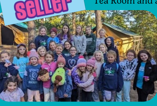
Quintess from from Nantucket Girl Scout Cadette Troop 67930 was the 2022 Top Fall Entrepreneur. She sold 431 products and earned $571.65 for her troop.

Girl Scout Daisy and Brownie Troop 70830 from Plymouth was the top selling 2022 Fall Product Program troop , earning $1,865.70 in troop profit. The troop used the proceeds to kick off their year planning badges and journeys, activities which included dinner out with the older scouts, a field trip to the planetarium, a trip to Shelly's Tea Room and a fall camping trip to Camp Favorite.